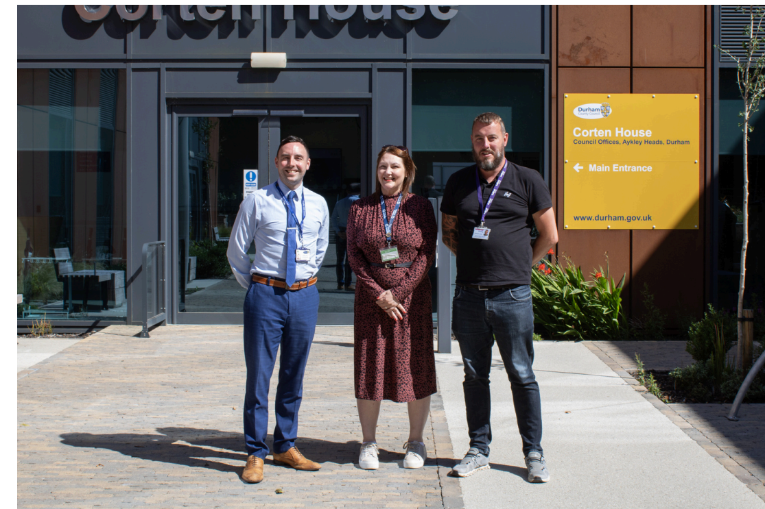
Some of The County Durham Pound Team